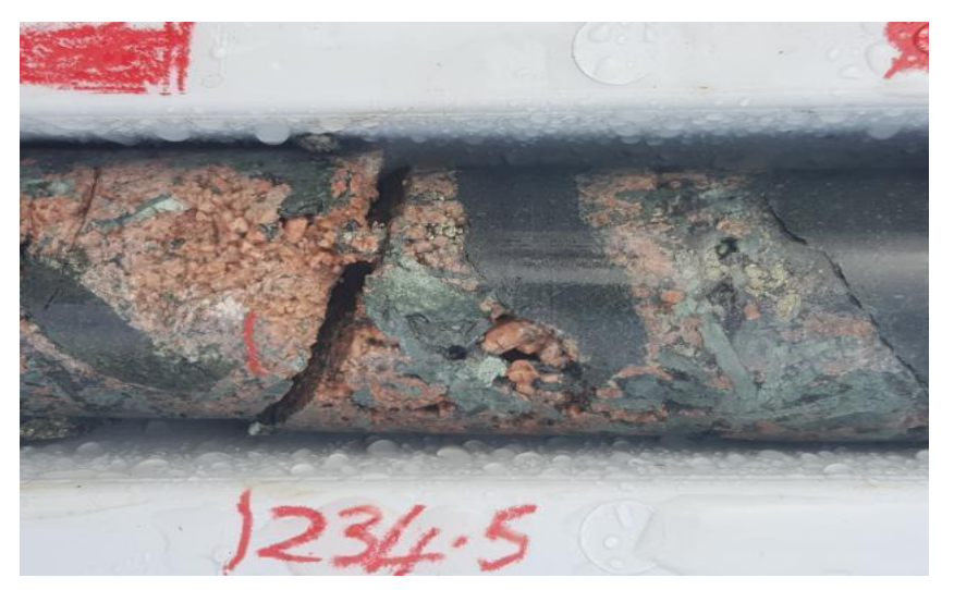
Picture 3: Vein bearing coarse bladed actinolite, euhedral kfeldar and pyrite clots.

Suite 4/16 Ord Street, West Perth, WA 6005