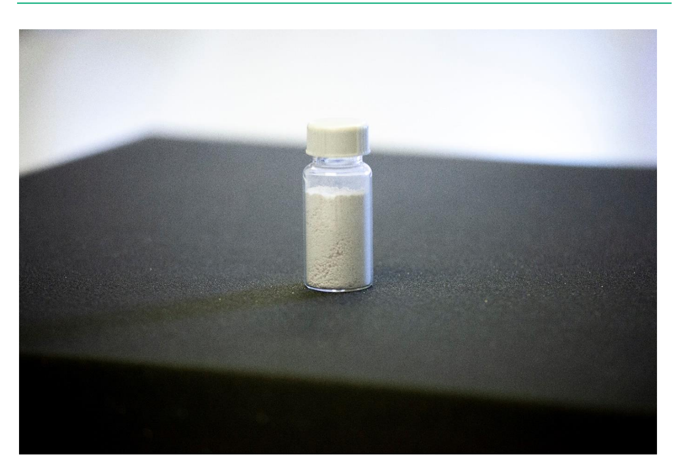
Figure 1: High purity manganese sulphate monohydrate crystals produced