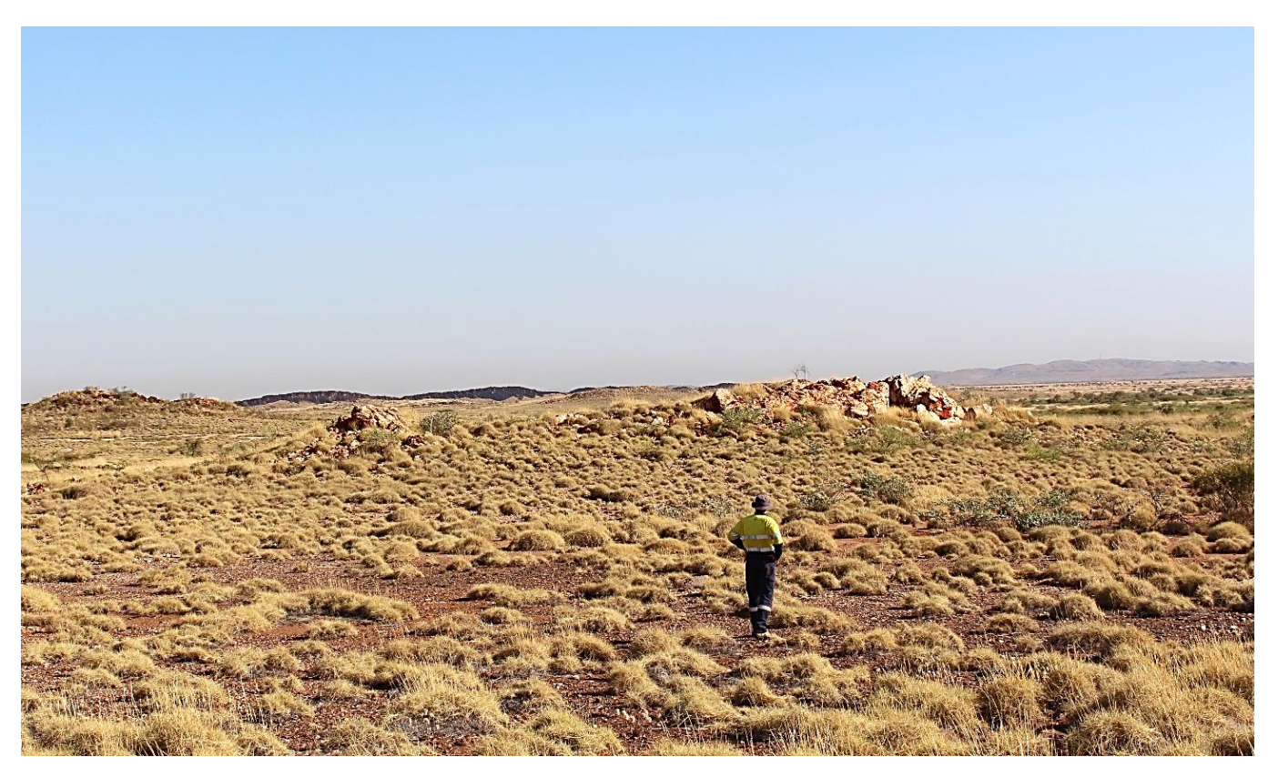
Figure 1: Project Manager onsite mapping Prinsep South pegmatite

Accelerate Resources Limited ("Accelerate" or "the Company") is pleased to announce that the Company has completed a high-resolution aerial imagery and digital elevation survey across the Prinsep Lithium Project to assist with identifying additional lithium pegmatites and generation of drill targets.