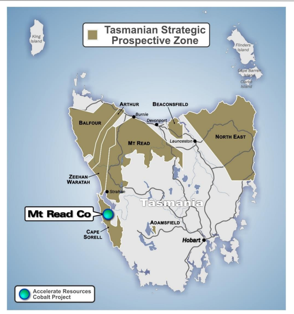
Figure 2: Mount Read Cobalt project location within the Tasmanian Strategic Prospective area