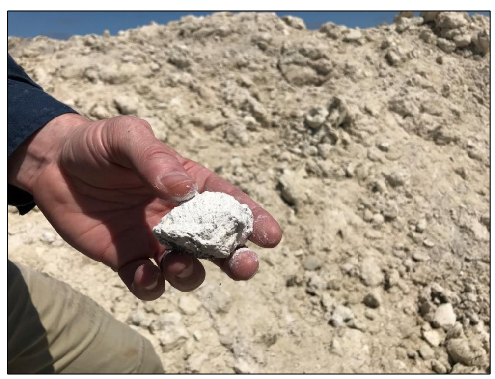
Photo 2: Surface sample inspection during site visit at the Tambellup project.