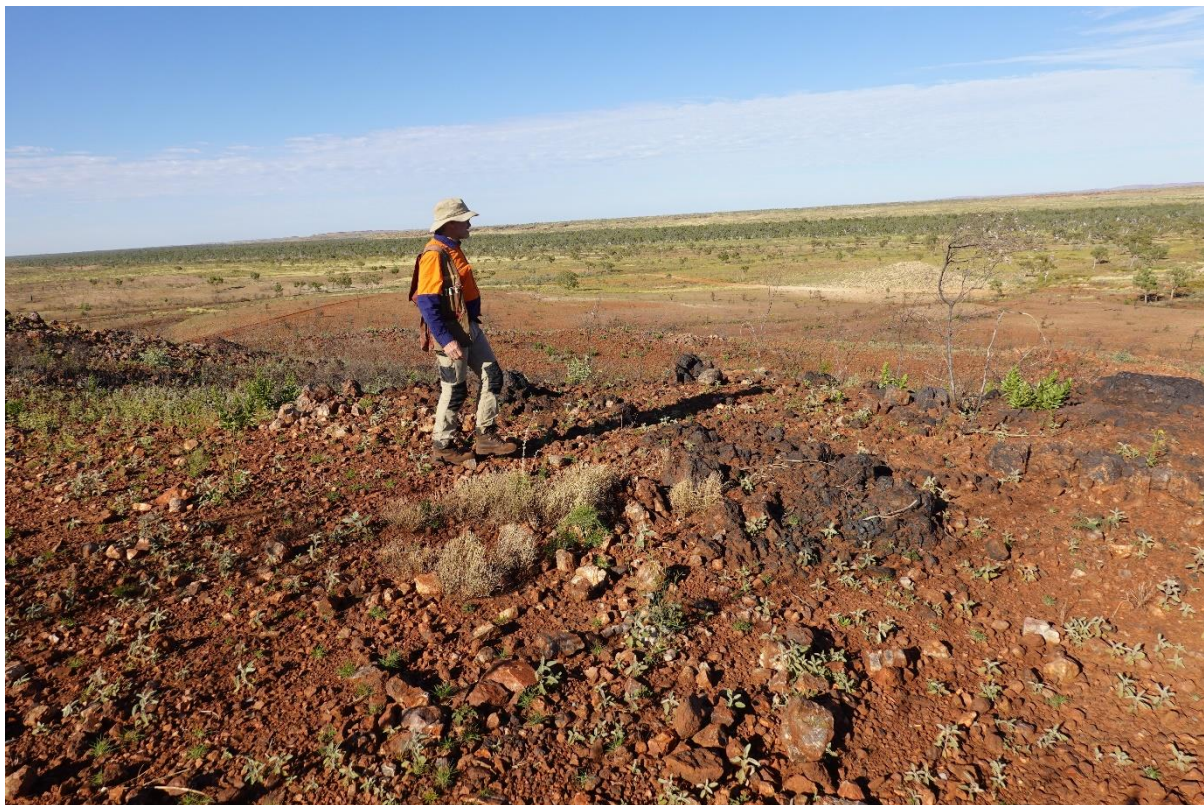
Figure 5: Dr Joe Drake-Brockman Mapping at Woodie Woodie North Manganese Project

Approximately 2.25 km outcrop of stacked manganese mineralised layers were geologically mapped at Area 42 (Braeside) within a layered sequence of sedimentary chert breccia. This has increased the target strike length by around 1.75 km. These stacked zones vary from 15 m to 100 m in width and possibly penetrate similar distances down-dip into the layered chert. Portable XRF measurements on previously collected grab samples and shallow drilling has indicated that near surface, high-grade manganese pods (30-55% Mn) 2 exist within these zones. However, the surrounding and deeper material is likely to be of low to moderate grades.