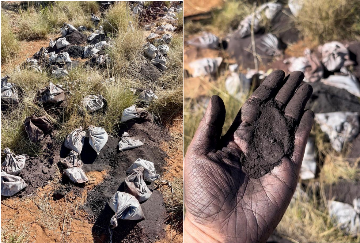
Figure1 – Drill hole WWN22_017 intersects very thick manganiferous zones at Woodie Woodie North, Braeside West Prospect