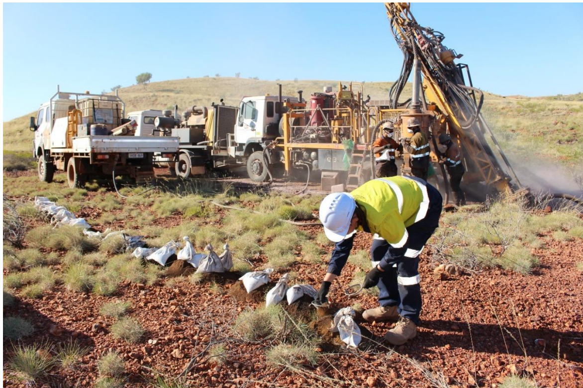
Figure2 – Drilling at Woodie Woodie North Manganese Project, Barramine Prospect

“Our maiden drilling program at Woodie Woodie North has exceeded our expectations. The drilling has successfully intersected a potential large mineralisation system geologically similar to deposits currently being commercially mined at the Woodie Woodie mine to our south. With positive metallurgical test work results to-date, we are well positioned to become a future supplier of premium Manganese product, and to meet the surging demand of manganese in the electric vehicle supply chain.”